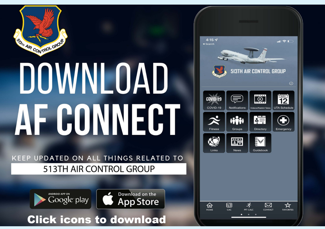
Rabbit Tales // 6 // April 2022

Once you have the app installed, just add 513th Air Control Group to your favorites, and get connected with the 513 ACG.