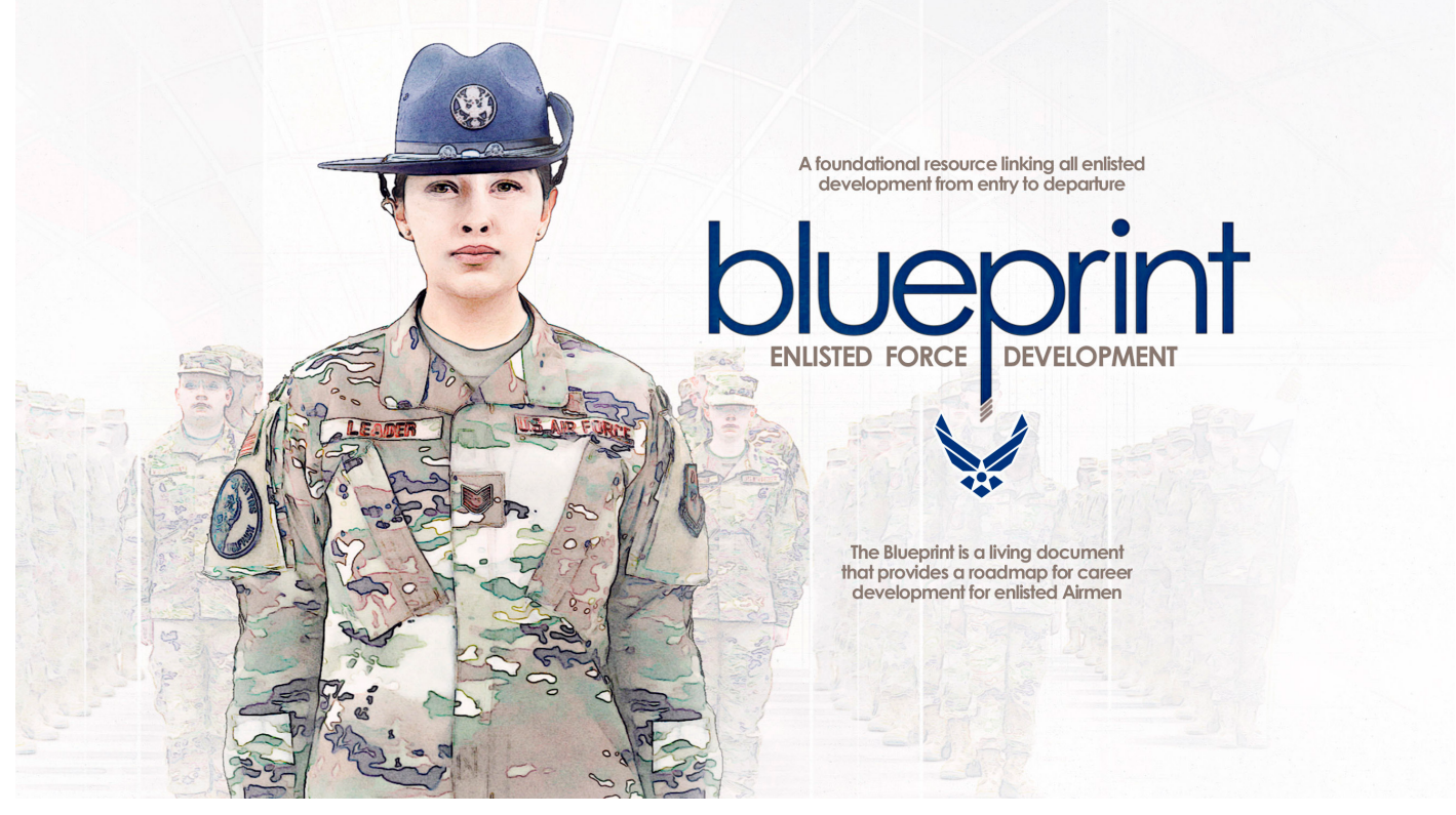
The Blueprint is a constantly-evolving foundational resource linking all enlisted development from entry to departure. (U.S. Air Force graphic by Travis Burcham)

It also serves as a guide for open dialog among supervisors and peers and may be used during feedback sessions, professional develop-